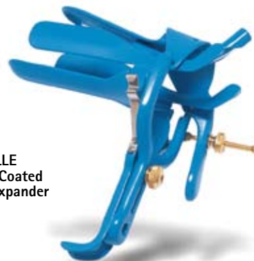
ES-16132-LLE Large LETZ-Coated Four-Way Expander

also available in uncoated stainless steel and autoclavable resin models